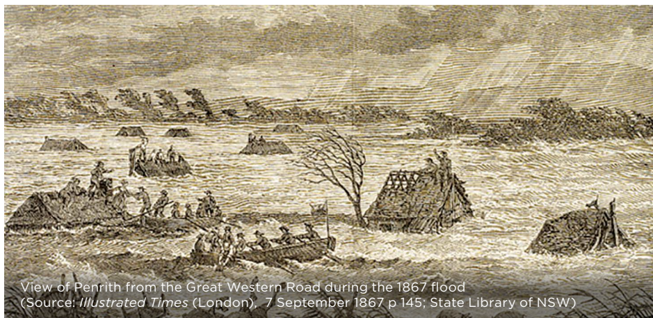
View of Penrith from the Great Western Road during the 1867 flood

Large floods don't happen often, but when they do they have very significant impacts on the community.